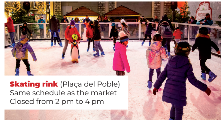
Skating rink (Plaça del Poble) Same schedule as the market Closed from 2 pm to 4 pm